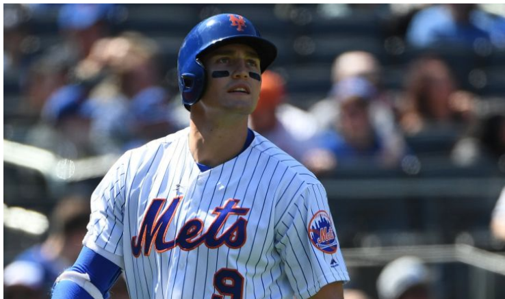
Mets leftfielder Brandon Nimmo returns to the dugout after he strikes out leading off during the first inning against the Nationals at Citi Field on April 6.